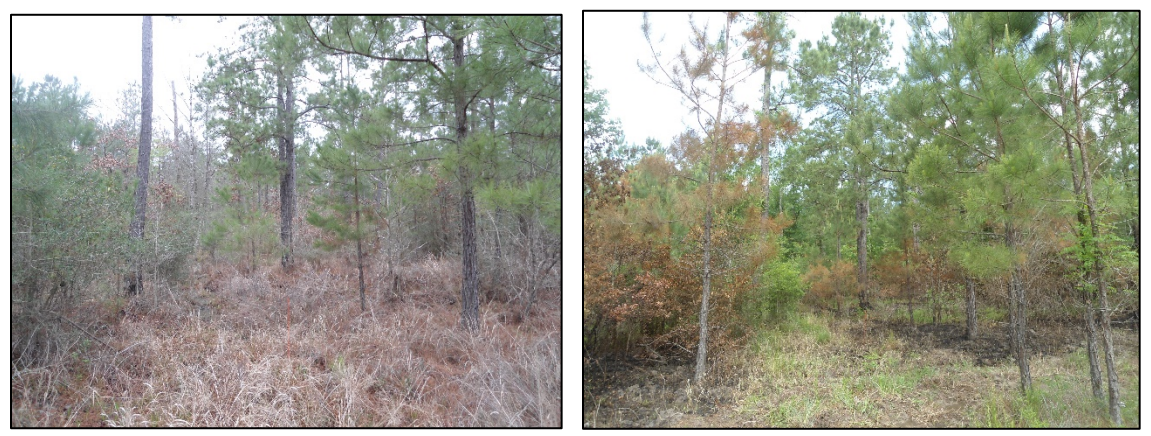
298 acre mixed species stand in Trinity County.

731 acres of loblolly pine plantations within a priority watershed in Nacogdoches County.